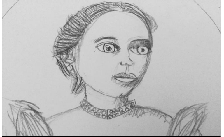
Margaret Brown ( the unsinkable Molly Brown )

706 people survived. These included first, second and third class people. They continued their journey on the RMS Carpathia where they were taken care of and are now safely in New York. Though the tragedy has happened some survivors refuse to say anything.